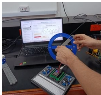
Figure 3. Tests performed by students of the Mechatronics Engineering program.

These findings are consistent with recent studies on active learning in IoT-based environments [1], where the combination of physical hardware and digital simulation increases conceptual retention and student motivation (Figure 3).